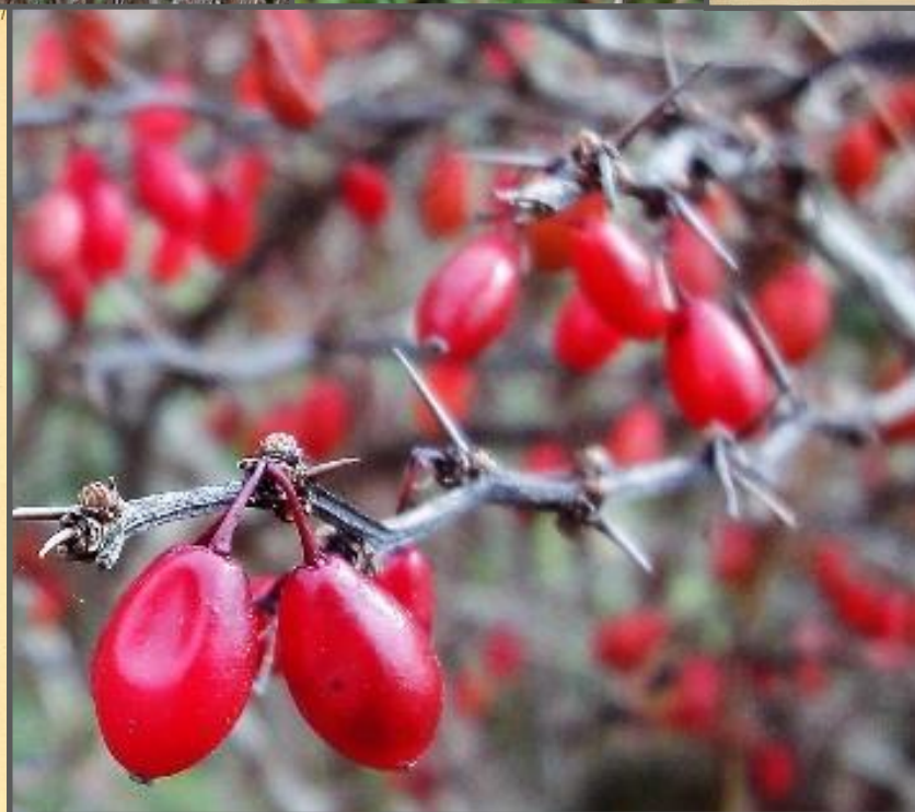
BARBERRY ( BERBERIS VULGARIS )